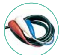
MODEL 8031 Standard type